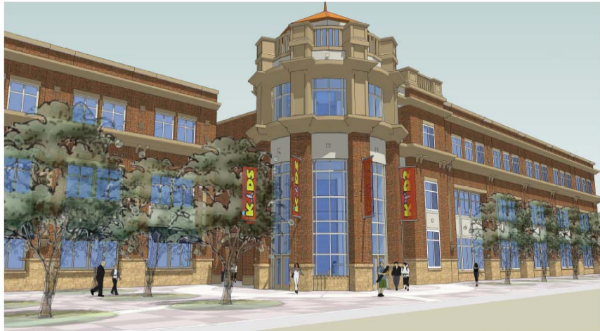
Proposed Town Center Plaza